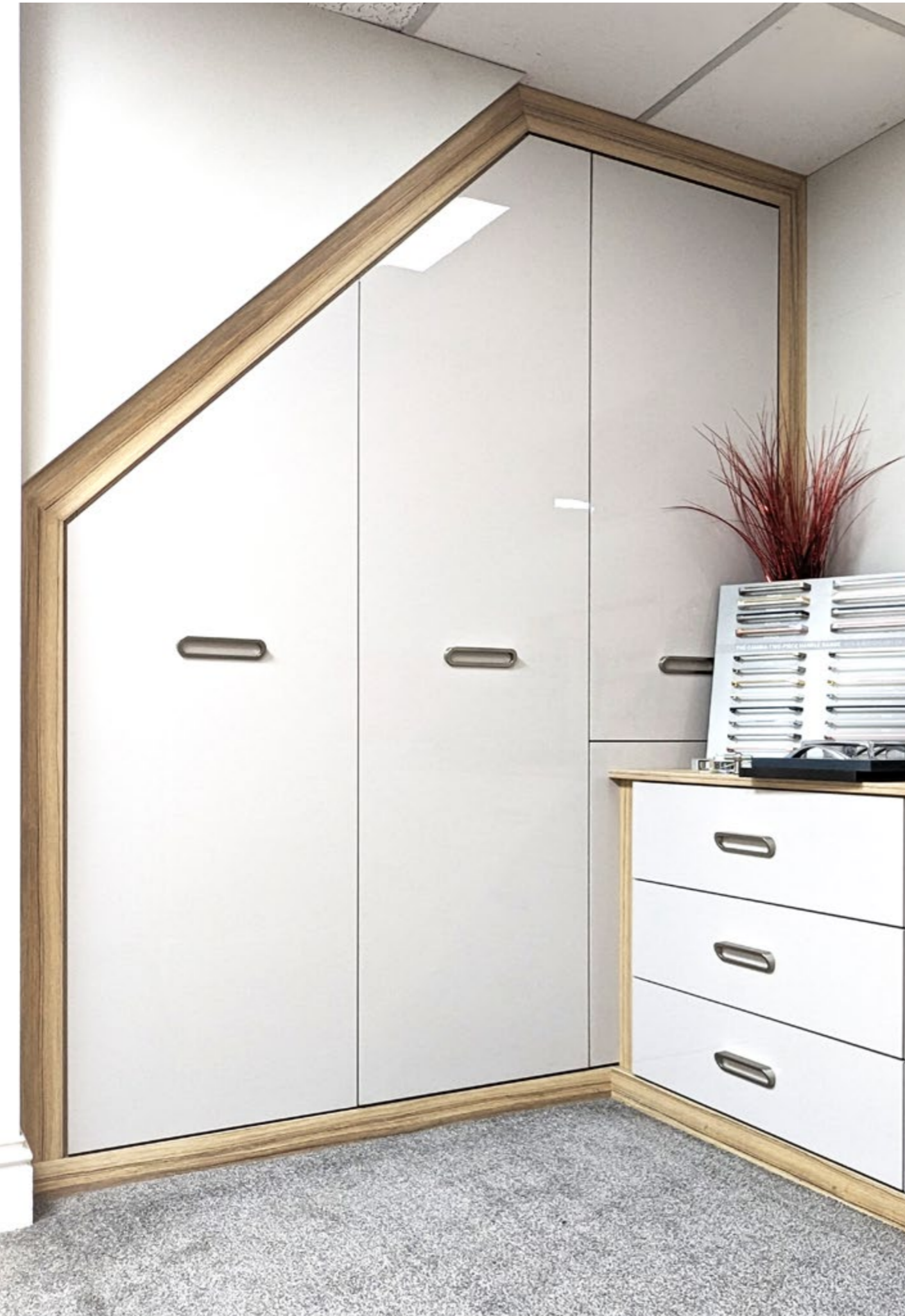
From design to full installation. Let us create your dream home.