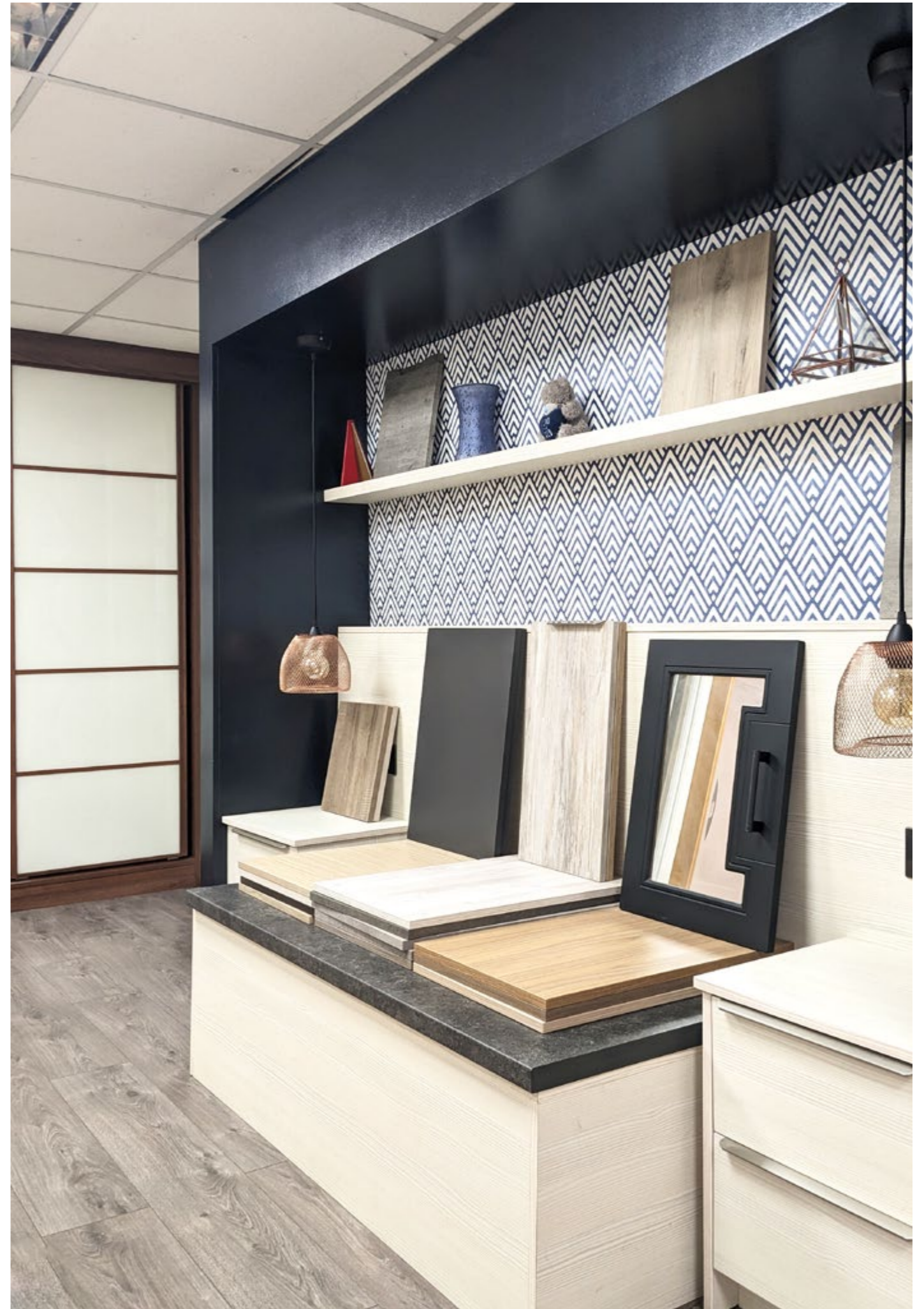
Ideal Home Improvements